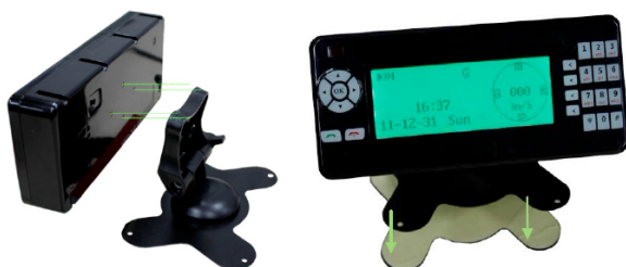
GSE-MDC accessories for vehicle installation